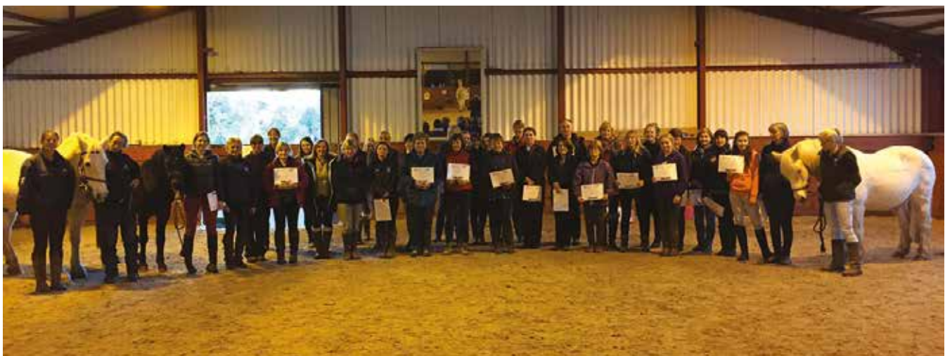
The successful Horse Owner Course participants receive their certificates!