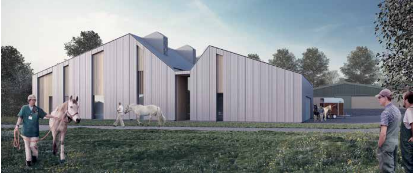
Architect's impression of the new equine unit

A £3.7 million Equine Diagnostic, Surgical and Critical Care Unit is being built at the Dick Vet, to enhance both learning for students and treatment for horses.