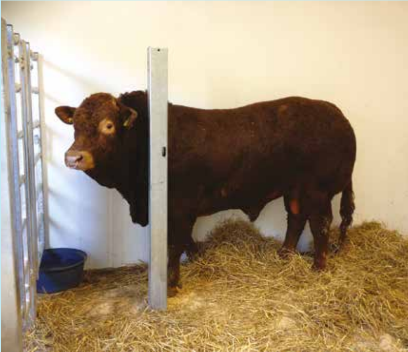
The new isolation pens allow us to handle any farm animal species, from sheep to pedigree bulls.