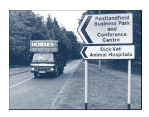
The signs to follow.

Phase I of the LAH rebuilding plan is complete and fully functional. This consists of about 30 equine boxes under cover with two treatment areas and a colic box. Each of the treatment areas and the colic box have purpose-built stocks and associated benches and cupboards. A temporary pharmacy, and feed, tack and store rooms are functioning. The Isolation Unit also is finished and ready for use. This consists of two horse boxes with adjacent prep/gowning/store rooms and