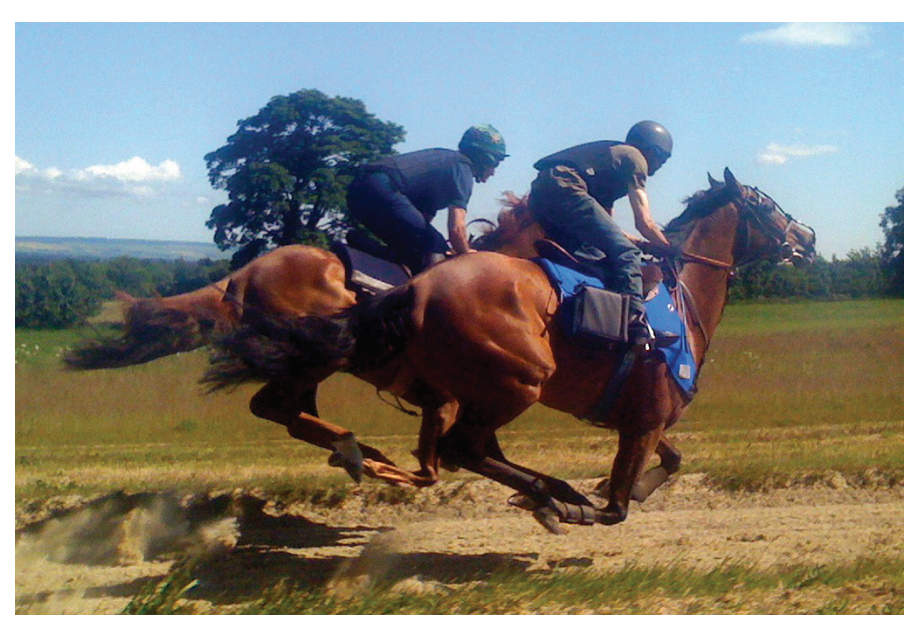
Figure 1: Two racehorses exercising as part of their regular training regime in Yorkshire, the one closest to the camera has the over-ground endoscope in place.

Figure 2: An endoscope picture from the over-ground exercising endoscope equipment, showing a horse following a tie-back on the left side (arrow), this cartilage is held permanently in an abducted position.