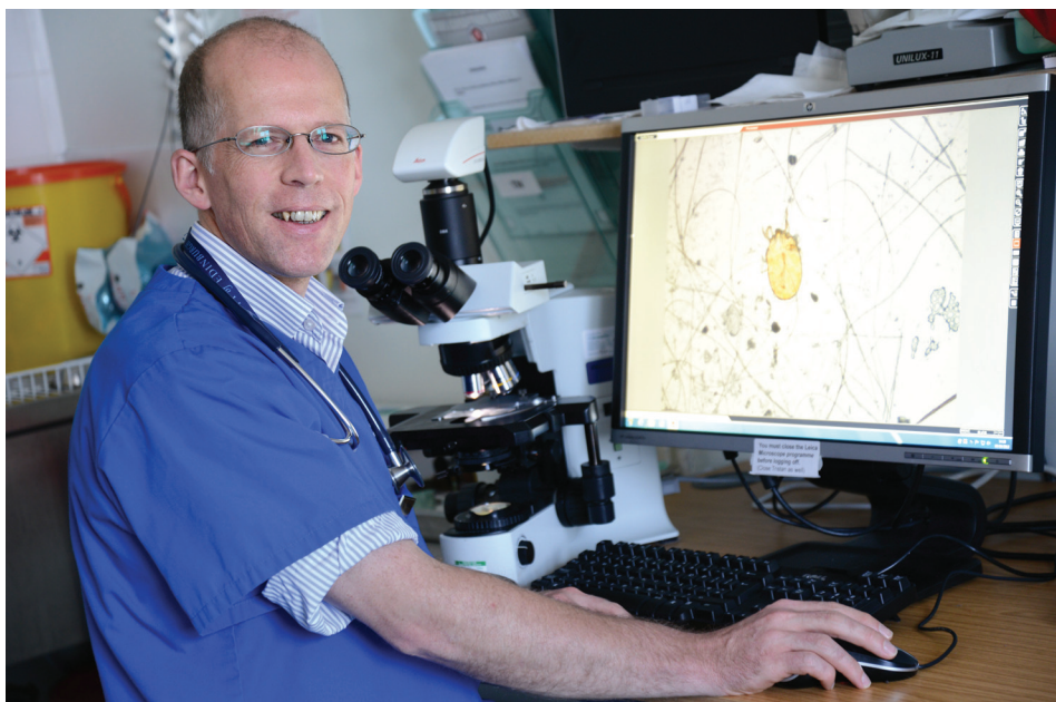
The Dermatology service has a dedicated treatment area in the Hospital for Small Animals.