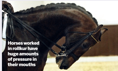
Horses worked in rollkur have huge amounts of pressure in their mouths

Heart rate, heart-rate variability, salivary cortisol concentration — which can indicate levels of stress — behaviour and the tension in reins were recorded.