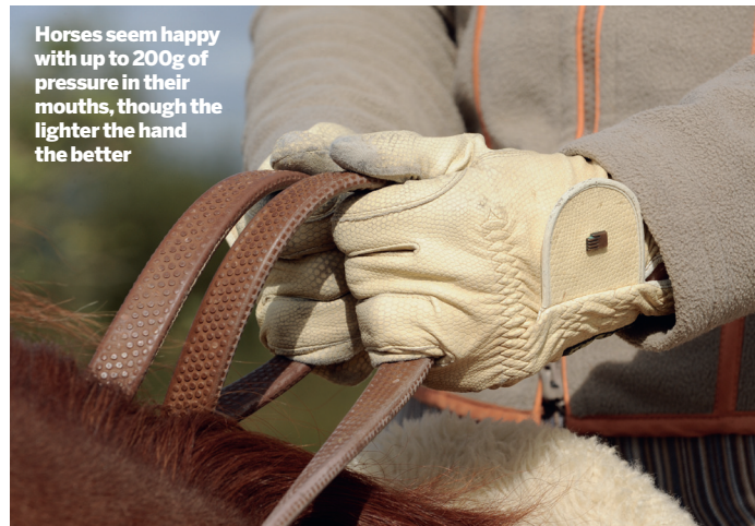
Horses seem happy with up to 200g of pressure in their mouths, though the lighter the hand the better

► Pressure testing: scientists have developed special pads to measure how much pressure is applied from the rider's leg or