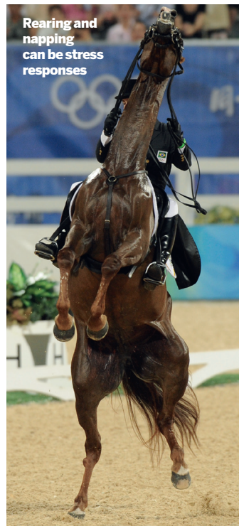
Rearing and napping can be stress responses

► Rein tensiometry: This is a measure of rein tension, ie how heavy or light a horse is in the hand.