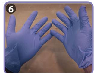
6 Once gloved, touch only the procedure site and required instruments