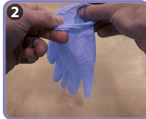
2 Touch only the edge of the cuff