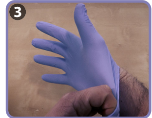
3 Insert the opposite hand being careful to avoid damage with nails