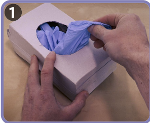
1 Take the first glove from glove box