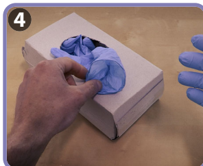
4 Take a second glove with the the bare hand