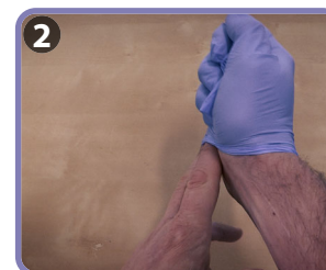
2 Hold the empty glove in the gloved hand. Slide your bare fingers between the skin and wrist of the remaining glove. Pinch and roll the second glove down over the first