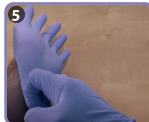
5 Avoid touching the forearm of the ungloved hand by folding the cuff edge over and pulling on with gloved hand