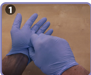
1 Pinch one glove at wrist level without touching the skin, pull away allowing the glove to turn inside out