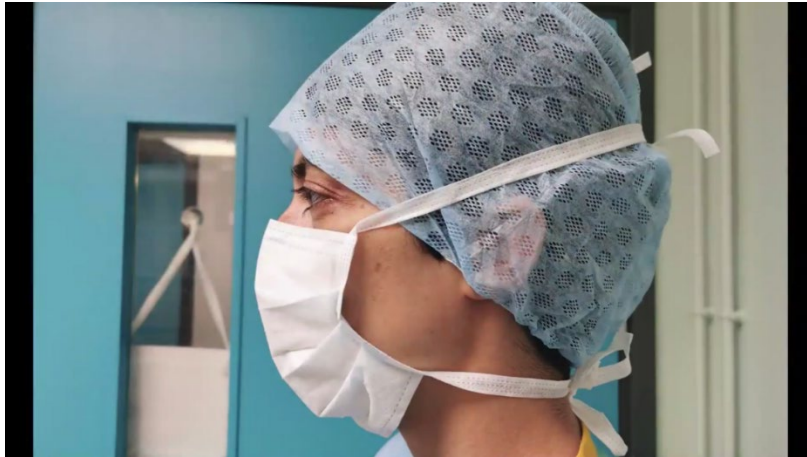
Surgical hat and mask being worn correctly

Ideally all staff working in the surgical area should have their hair covered by a clean, re-usable or disposable surgical hat, ensuring that long hair is fully tucked into the hat. This is to prevent the possible contamination of the sterile field by falling hair or dandruff.