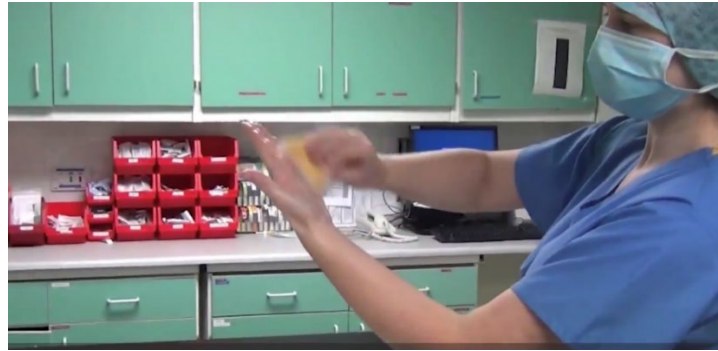
Apply 20 strokes to the webs of the fingers