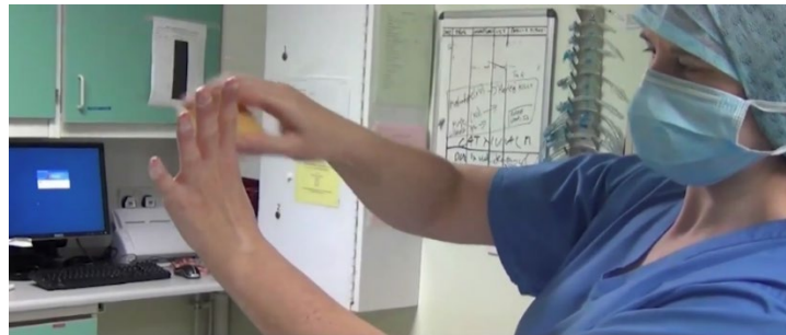
Divide hand into 4 parts and apply 20 brush strokes to each part