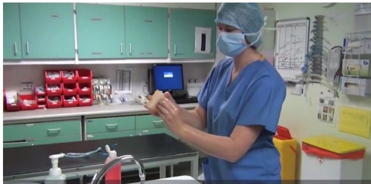
Apply 30 strokes to the tips of fingers and thumb