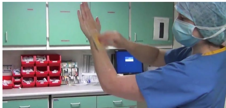
Divide arms into top and bottom (top closest to wrist)