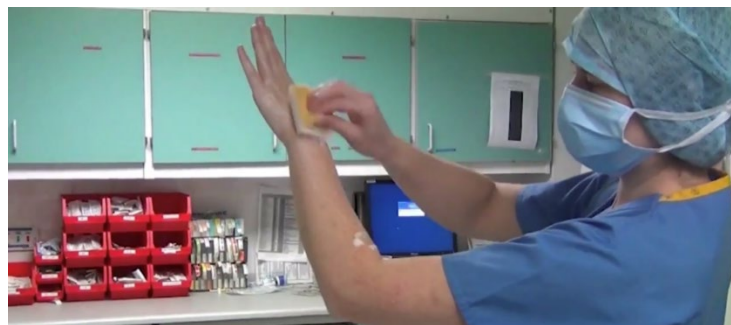
Divide top of arm into 4 parts and apply 20 brush strokes to each part