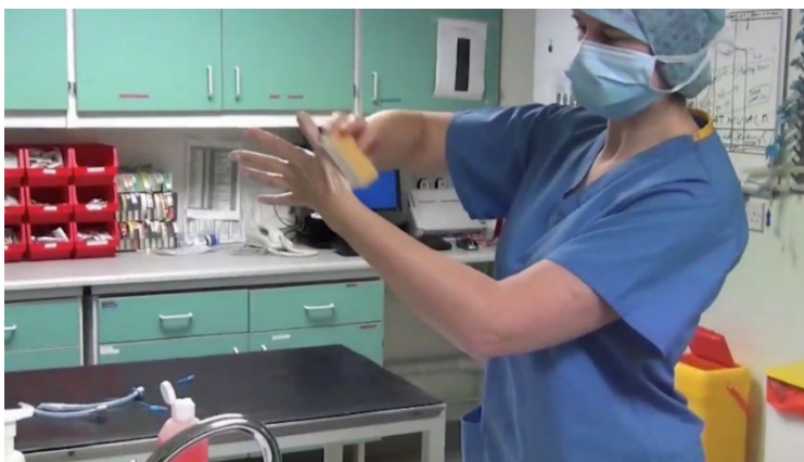
Divide each finger and thumb into 4 parts and apply 20 strokes to each of the four surfaces