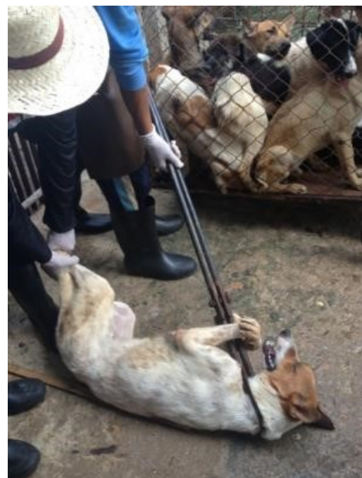
Neckgraspers being used to handle a dog

For more information on dog behaviour and handling, please see the video and supporting document on this subject.